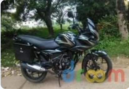
Bajaj Discover 150cc 2014