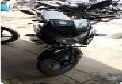
Bajaj Discover 150cc 2015