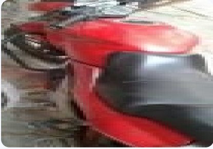
Hero CBZ 150cc 2010