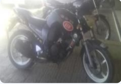
Yamaha FZ 150cc 2011