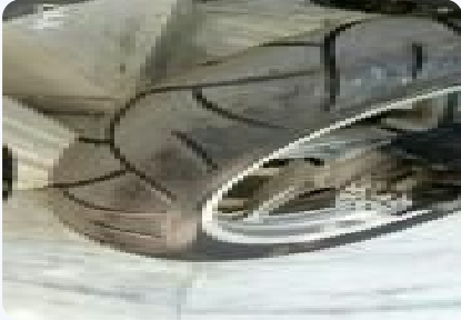
Honda CBR 250R 2012