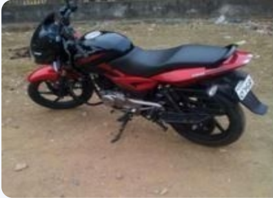
Bajaj Pulsar 150cc 2015