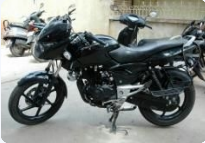
Bajaj Pulsar 150cc 2010