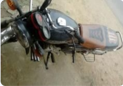
Yamaha Crux 110cc 2004