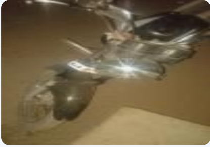
Bajaj CT 100 100cc 2003