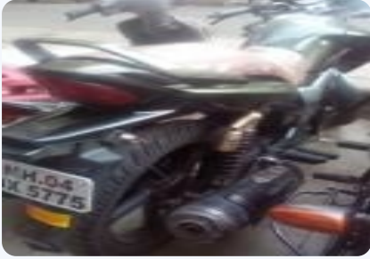
Hero Hunk 150cc 2009