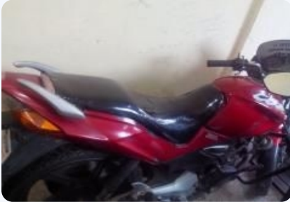
Hero CBZ 150cc 2008