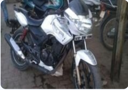
TVS Apache RTR 180cc 2012