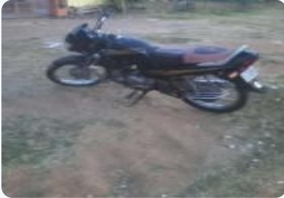
Hero Passion 100cc 2002