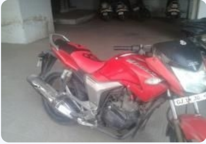
Hero Hunk 150cc 2008