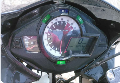
Hero Ignitor 125cc 2014