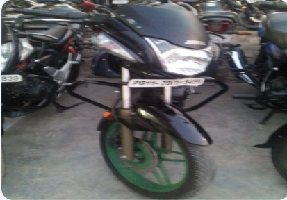
Hero CBZ 150cc 2010