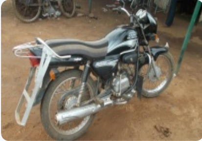
Hero Splendor Plus 100cc 2003