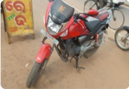
Hero CBZ 150cc 2012