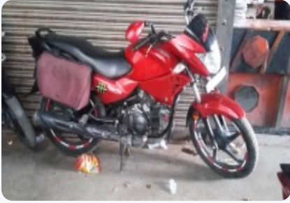
Hero Glamour 125cc 2010