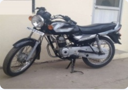
Bajaj CT 100 100cc 2005