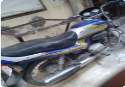
Hero Passion Pro 100cc 2005